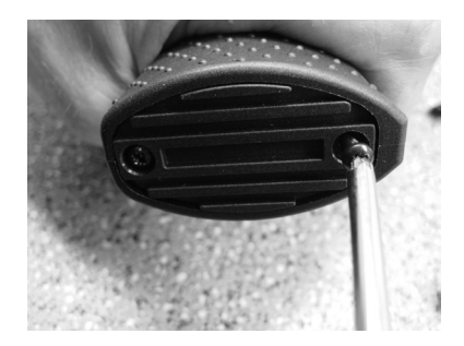
3. Unscrew the cover of the frame.