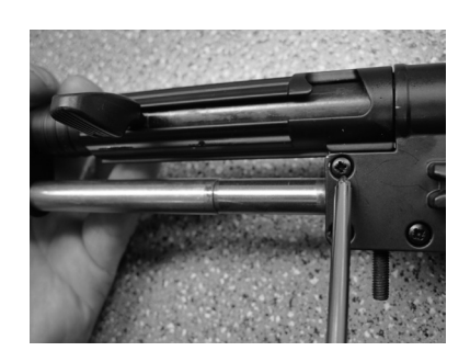
1. Unscrew the screws as shown.