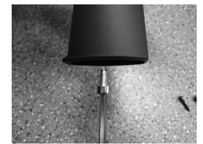
5. Unscrew the inside allen screw in order to remove the trigger group.