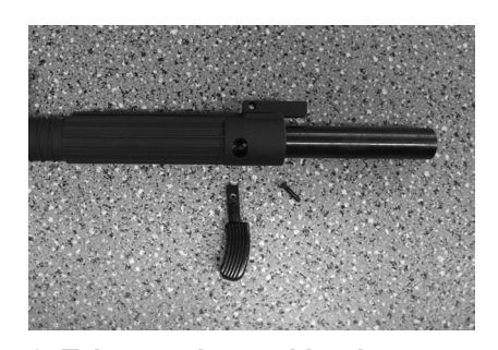
3. Take out the cocking lever first and than the inner tube.