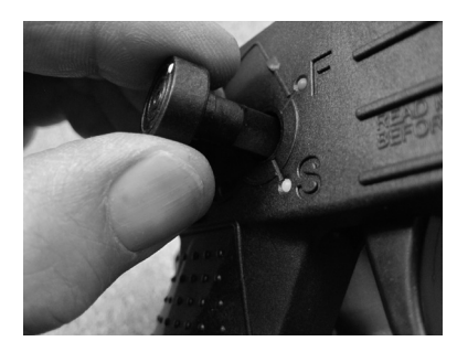
2. Remove the safety lever.