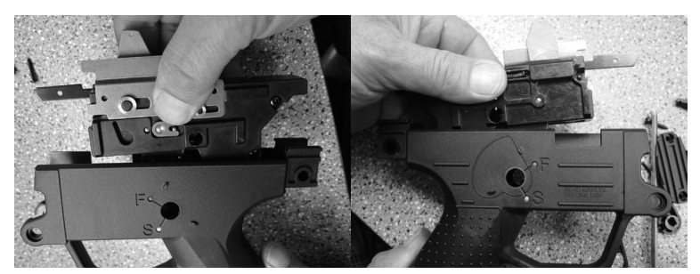
6. For changing the frame please follow the steps backwards.