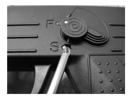
1. Unscrew the safety lever.