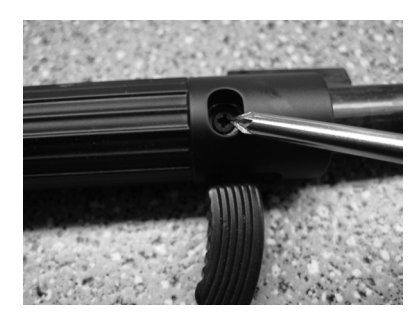
2. Unscrew the cocking lever.